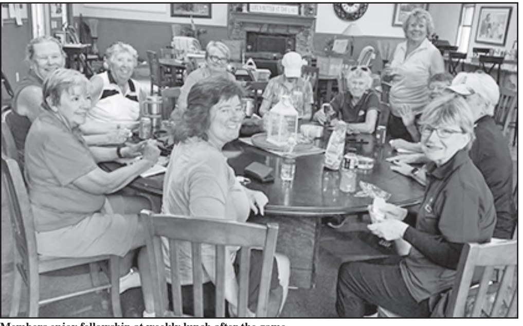
Members enjoy fellowship at weekly lunch after the game. The Chatuge Shores

Ladies Golf Association (CSLGA) played 18 holes on Tuesday, June 29th, but only the par 4s counted in the weekly game called The Fours Have It.